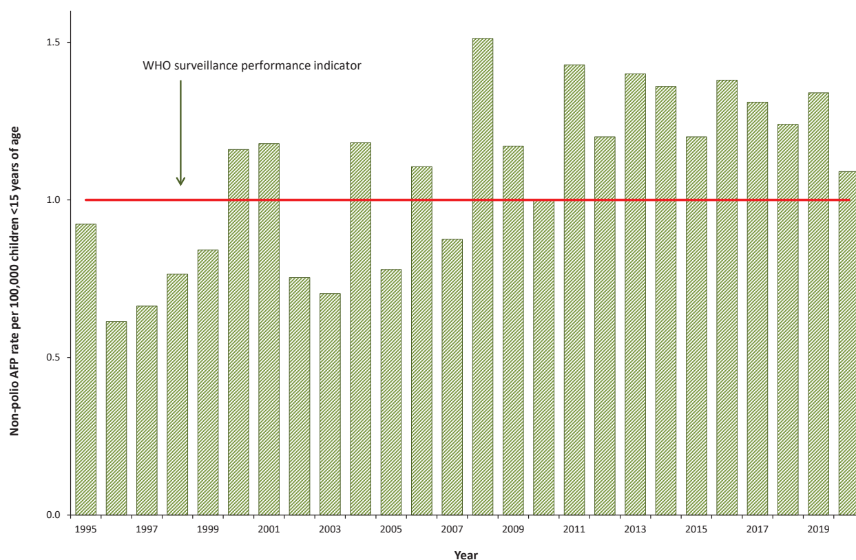
Figure 1: Non-polio acute flaccid paralysis rate, Australia 1995 to 2020 a